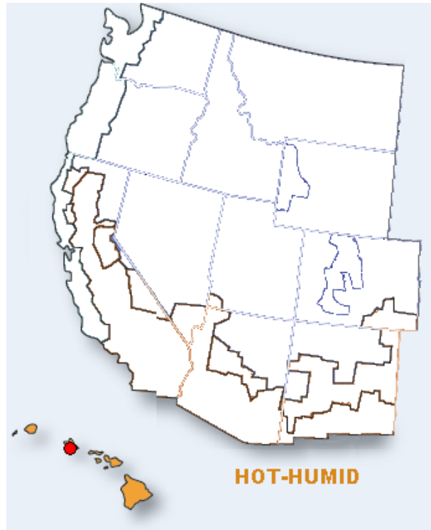
Figure 4 Location of BIRA Projects in the Hot/Humid Climate

Unique Features: Steel framing, Solar Electric, Thermal. There are interesting challenges related to who receives benefits and who pays costs of energy upgrades in military setting.