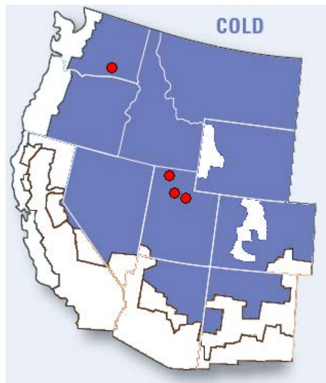
Figure 2- Location of BIRA Projects in the Cold Climate