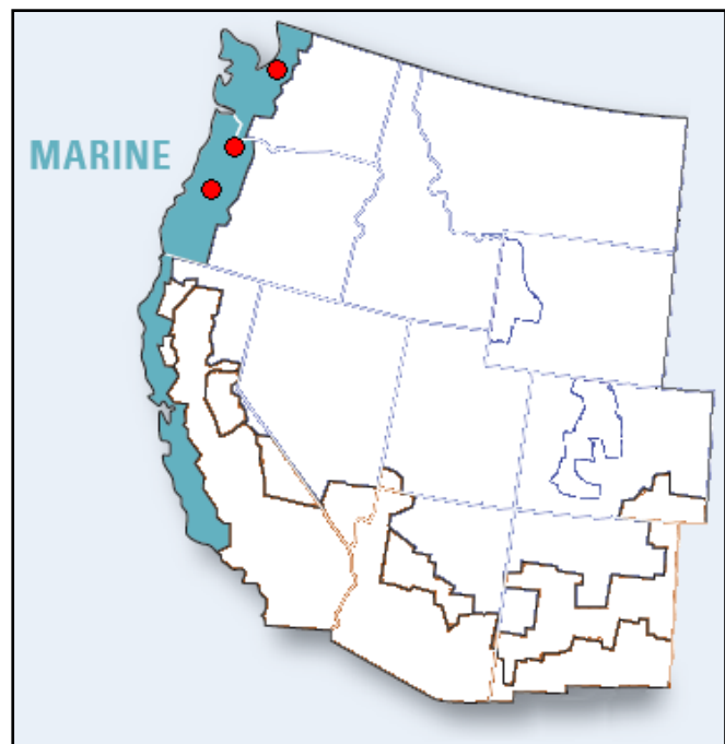
Figure 5 Location of BIRA Projects within the Marine Climate

Status: No homes have been completed with four homes currently under construction. Final build out will be 10 homes. Community analysis can begin in 2009.